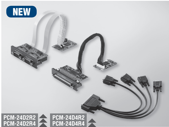
PCM-24D2R2 PCM-24D2R4 PCM-24D4R2 PCM-24D4R4

4-Port Non-Isolated RS-422/485 mPCIe, DB37 cable